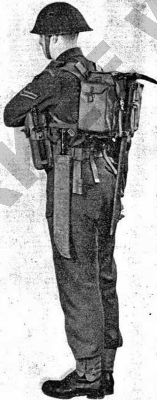
"44" PATTERN EQUIPMENT Left Side

It is intended to introduce the "44" pattern equipment on a maintenance basis as stocks of the "37" pattern are expended. It is anticipated that the change over will not commence until approximately 1949.