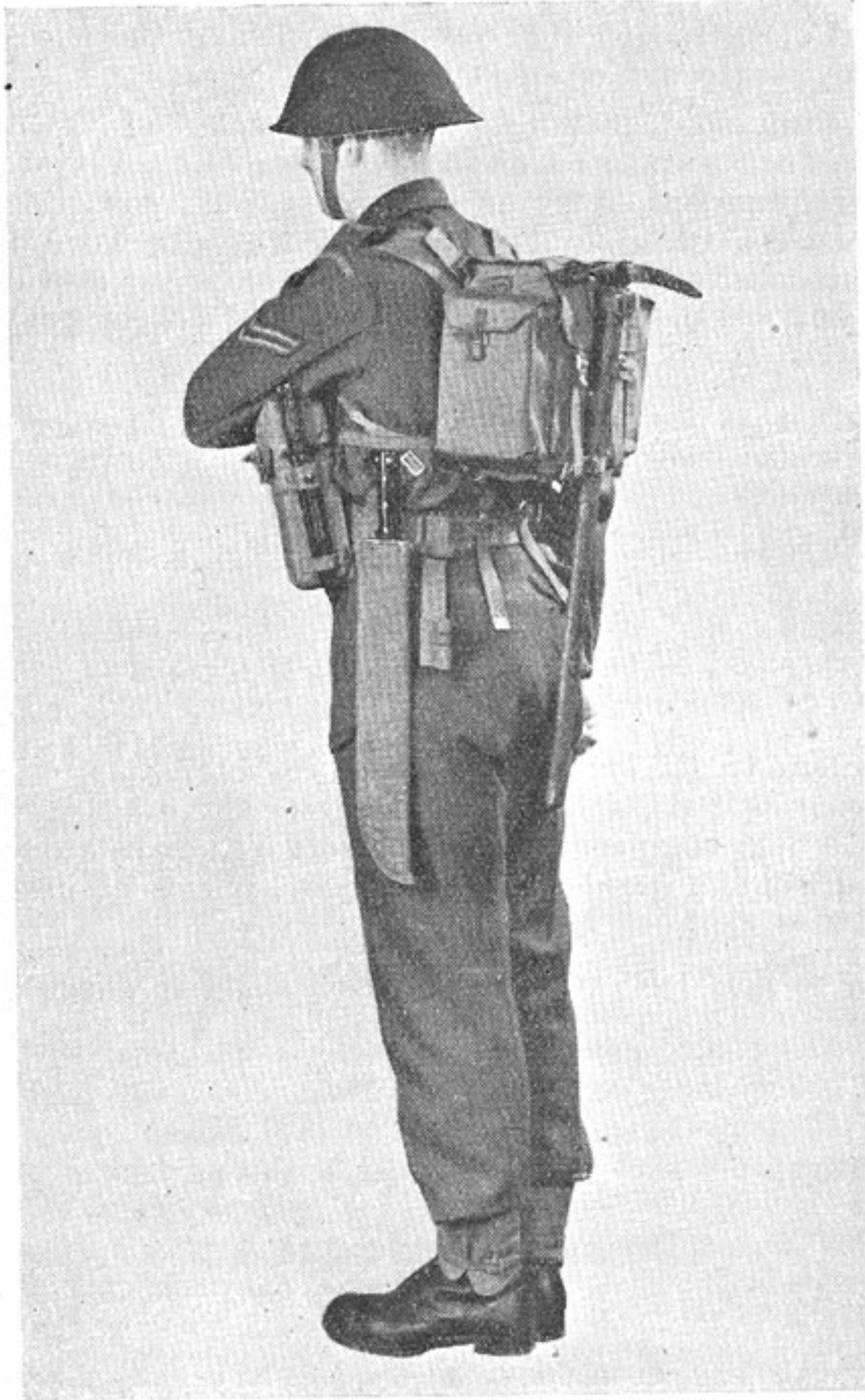
FIG 43—"44" pattern equipment—left side

3. Advantages. —The design of the equipment is basically the same as that of the "37" pattern equipment but it includes the following improvements :—